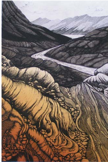
Eveline Kolijn, 2nd Place "Peyto Rock"