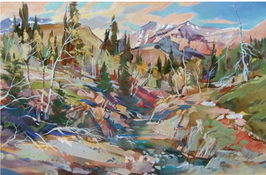
Left: Brent's final painting