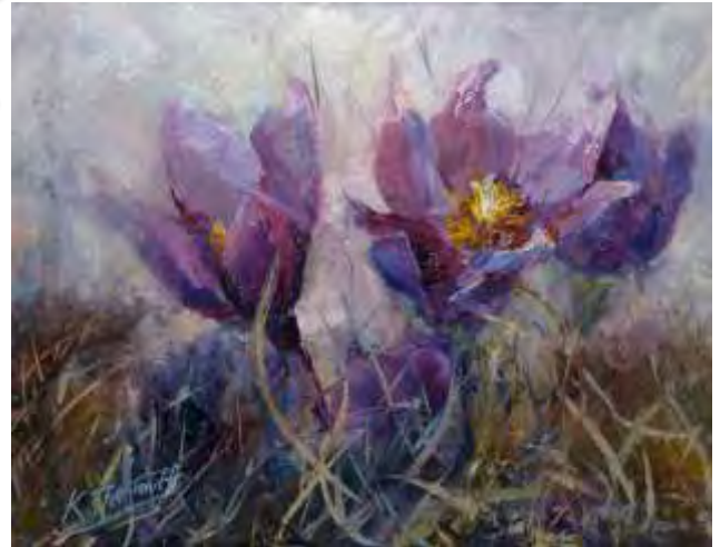
Kathleen Theriault "It Must Be Spring" Oil 14x18 $400.00 Second Place