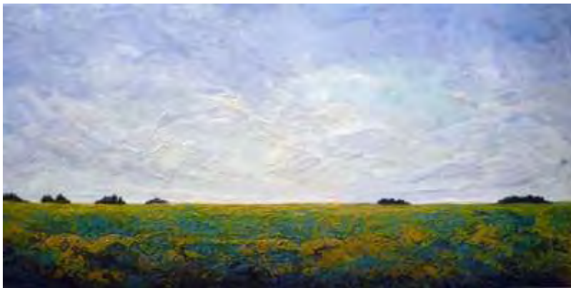
Tracy Proctor “Canola Series II” Encaustic 48x24 $1,585.00 Honourable Mention