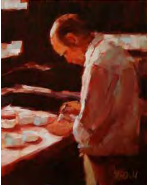
Donna MacDonald "Prep Work" Oil 8x10 $375.00 First Place