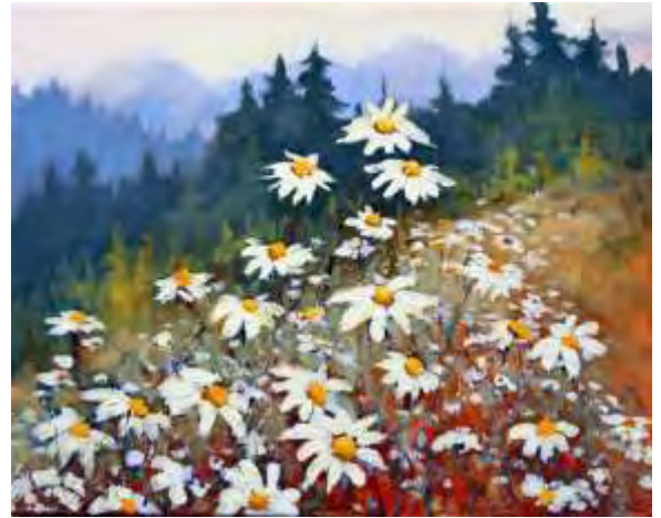
Linda Wilder “Field of Daisies” Acrylic 16x20 $795.00 Honourable Mention