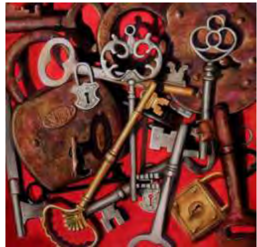
Kathy Hildebrandt “All Keyed Up” Pastel 18x18 $1,075.00 Honourable Mention