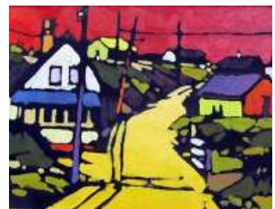
Day 3 Oil Demo