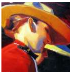
Day 2 Oil Demo