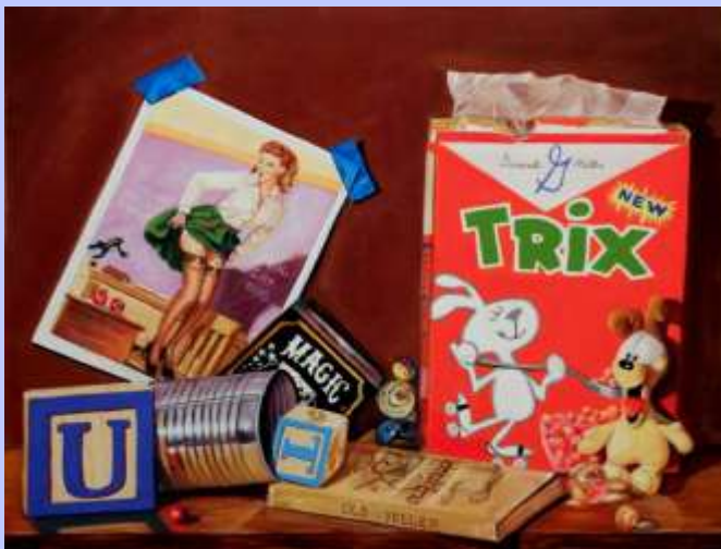
U CanT Teach an Old Dog New Trix Pastel 18"x24"